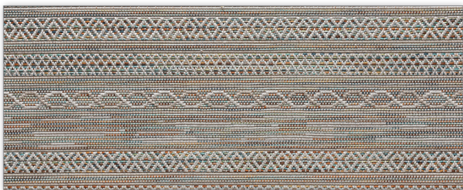
▲ 8217 / 14