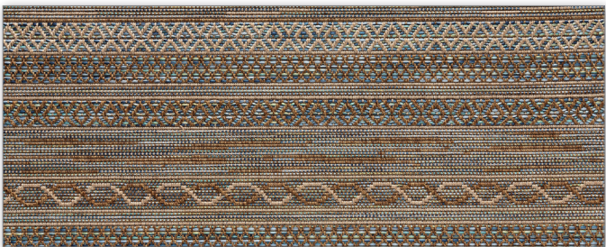
▲ 8217 / 75