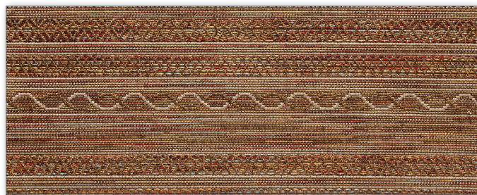
▲ 8217 / 73