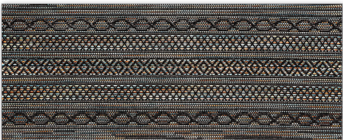
▲ 8217 / 94