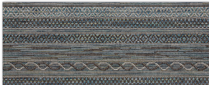
▲ 8217 / 85